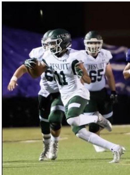
2020 WR Seth Jones